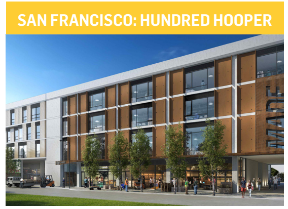
Figure 5 Comparson of Hundred Hooper and 25 Kent developments