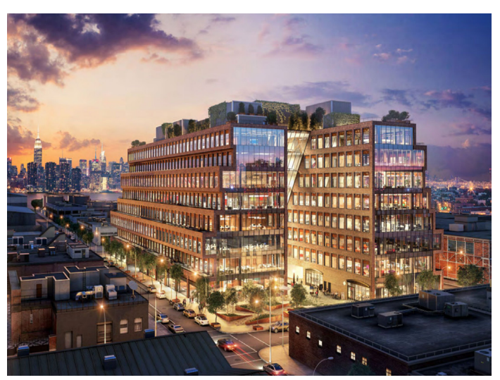
Figure 1 Rendering of 25 Kent Ave.