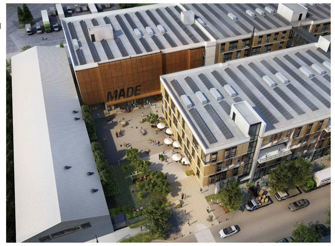
Figure 3 Rendering of Hundred Hooper