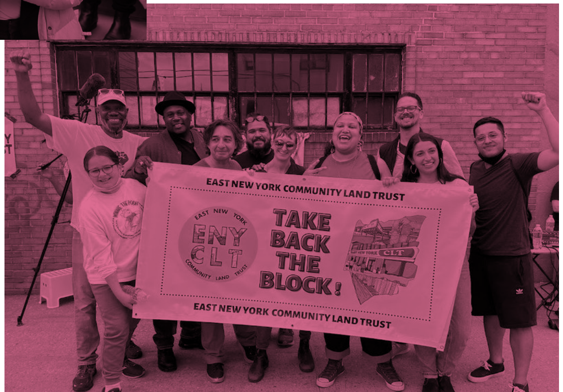
NYCCLI members at the public launch of the Queensboro People's Space project, organized by Western Queens CLT, in May 2022.

HPD should build out a CLT program that sets explicit commitments and strategies for CLT development, proactively identifies properties and projects suitable for CLT acquisition and stewardship, and coordinates with other city agencies to support CLTs. RFPs for disposition of city-owned land should be developed through local, participatory planning to ensure that plans align with community needs and existing community plans, including through CLTs, and HPD must be adequately staffed and committed to responsiveness and transparency with community partners.