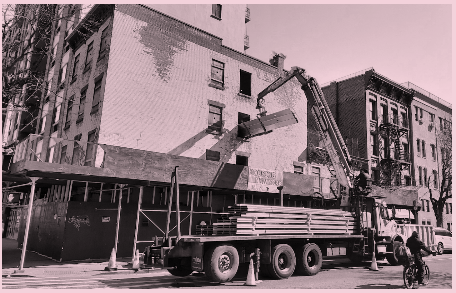
Rehabilitation of apartment buildings on the East Harlem-El Barrio CLT, 2021.