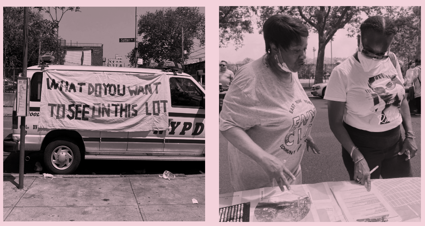
East New York CLT Black Paper #1 Release & Rally, May 21, 2022

residents anticipated that the related economic crisis would exacerbate existing cycles of capital disinvestment and speculation. ENYCLT organizers built on years of grassroots advocacy around the 2016 East New York rezoning, which coincided with rising land and housing costs, house-flipping and harassment by predatory investors, and privatization of public land.