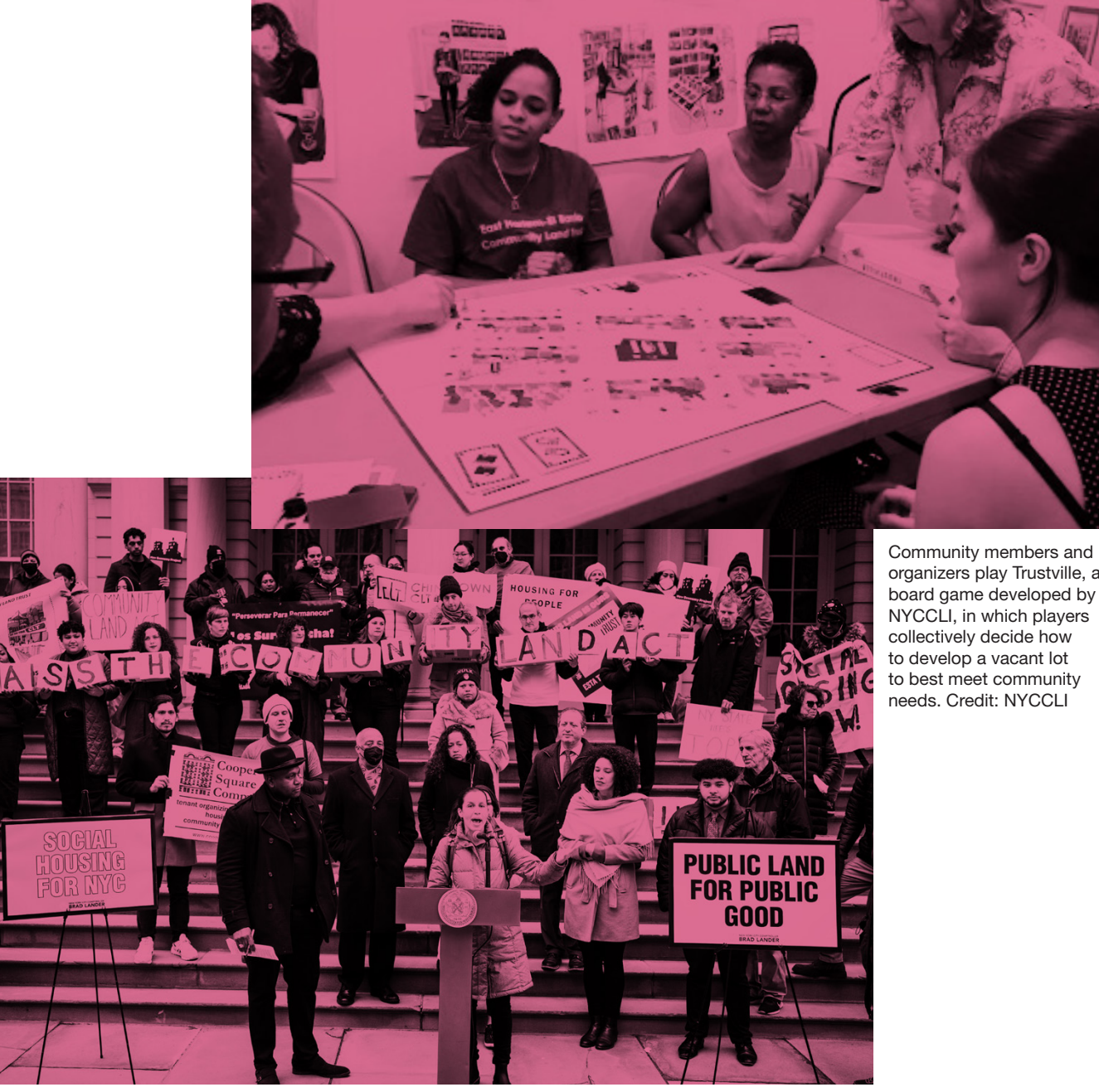
CLT organizers and elected officials speak out in support of the Community Land Act, prior to a hearing on the proposed legislation in February 2023.

New York City has seen Community Land Trusts (CLTs) emerge across the city as a strategy to combat land speculation and displacement of tenants, community organizations, and small businesses. The City has begun to implement policies to support this model as a result of community organizing and advocacy, yet most local CLTs are still advocating for land and securing mission-aligned financing remains a challenge. This report takes stock of growth of CLTs developing across the city, and examines policies that address current challenges to truly scaling and sustaining CLTs citywide.