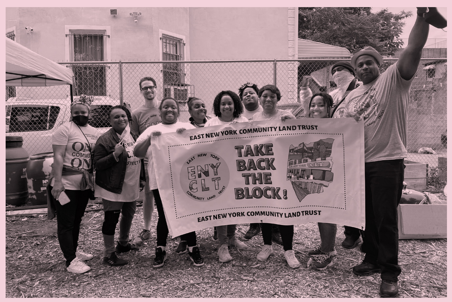
"This is Our Land" Tour and BBQ, June 2021, Credit: East New York CLT

The East New York Community Land Trust (ENYCLT) was organized in 2020 by residents of Brownsville and East New York, Brooklyn to preserve and create affordable homes, locallyowned small businesses, and green spaces that serve low to moderateincome BIPOC residents in those neighborhoods. The CLT emerged during the COVID pandemic, as