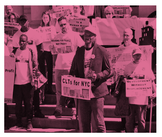
NYCCLI members rally at City Hall in May 2019, calling on the City Council to fund CLT organizing through the citywide CLT initiative.