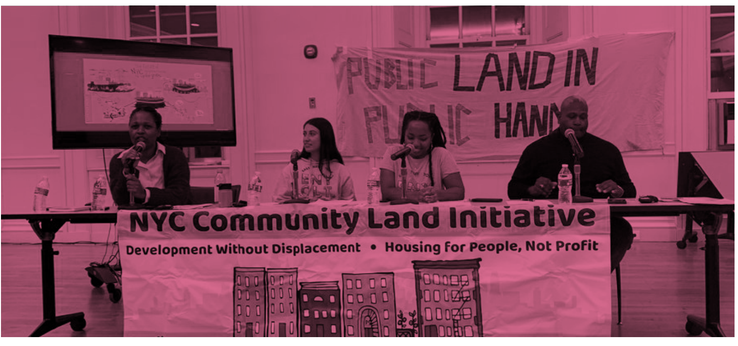
NYCCLI's Brooklyn Town Hall drew 80+ participants to learn about CLTs and the Community Land Act, in February 2023.

Director of Community Land Trust Initiatives and Analytics to coordinate CLT policies across the agency. In 2021, HPD, along with several other city agencies, issued a request for information from organizations working on shared equity models, including CLTs and housing cooperatives and worker cooperatives, credit unions, and others. The Adams administration's Housing Blueprint plan highlights the expansion of CLTs.9 As of 2022, HPD committed resources to 1,000 homes on four CLTs in the form of tax exemptions, direct funding for rehabilitation and construction, and land dispositions.<sup>10</sup>