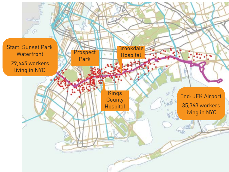
Proposed route: Sunset Park to JFK

This map shows one of the Pratt Center's proposed routes, connecting the Sunset Park industrial zone in Brooklyn with JFK Airport and important destinations in between. The route falls within one half mile of 602,932 NYC residents and 206,449 workers, including 33,292 who commute more than one hour each way to earn less than $35,000 annually. Each red dot represents 100 of these low-income extreme commuters.